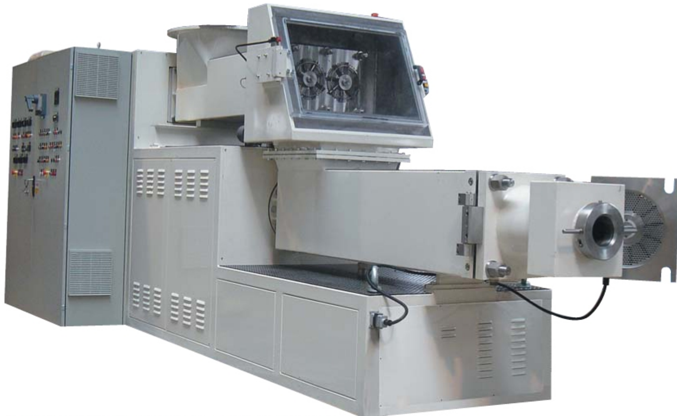
DUPLEX VACUUM PLODDER